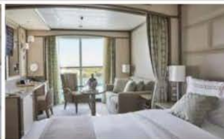
Deluxe Veranda Suite fr USD 20,300 p.p