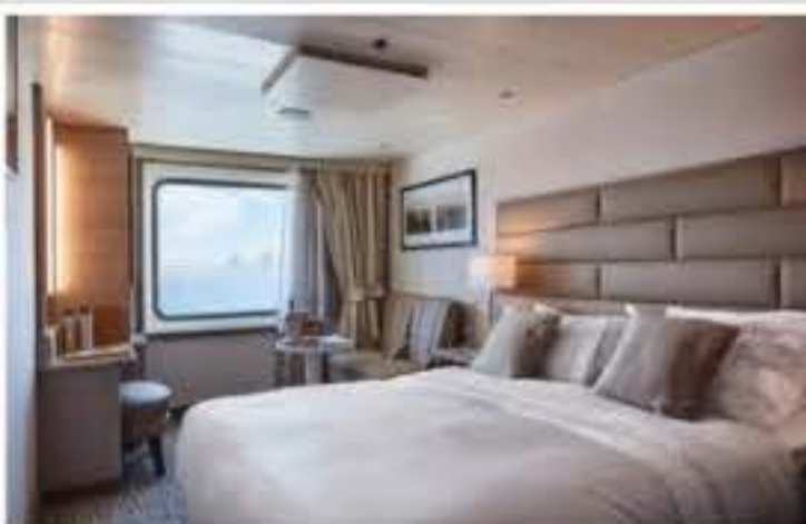
Vista Suite fr USD 15,000 p.p