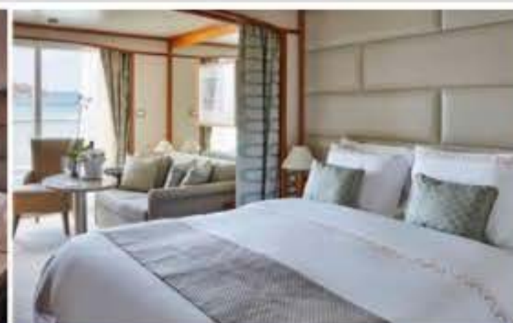
Classic Veranda Suite fr USD 18,500 p.p