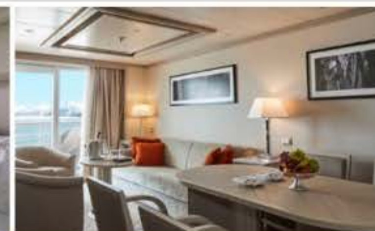
Medallion Suite fr USD 30,900 p.p

EXCLUDE : Tiket Pesawat PP, visa, personal expenses Fares and amenities quoted may change at any time